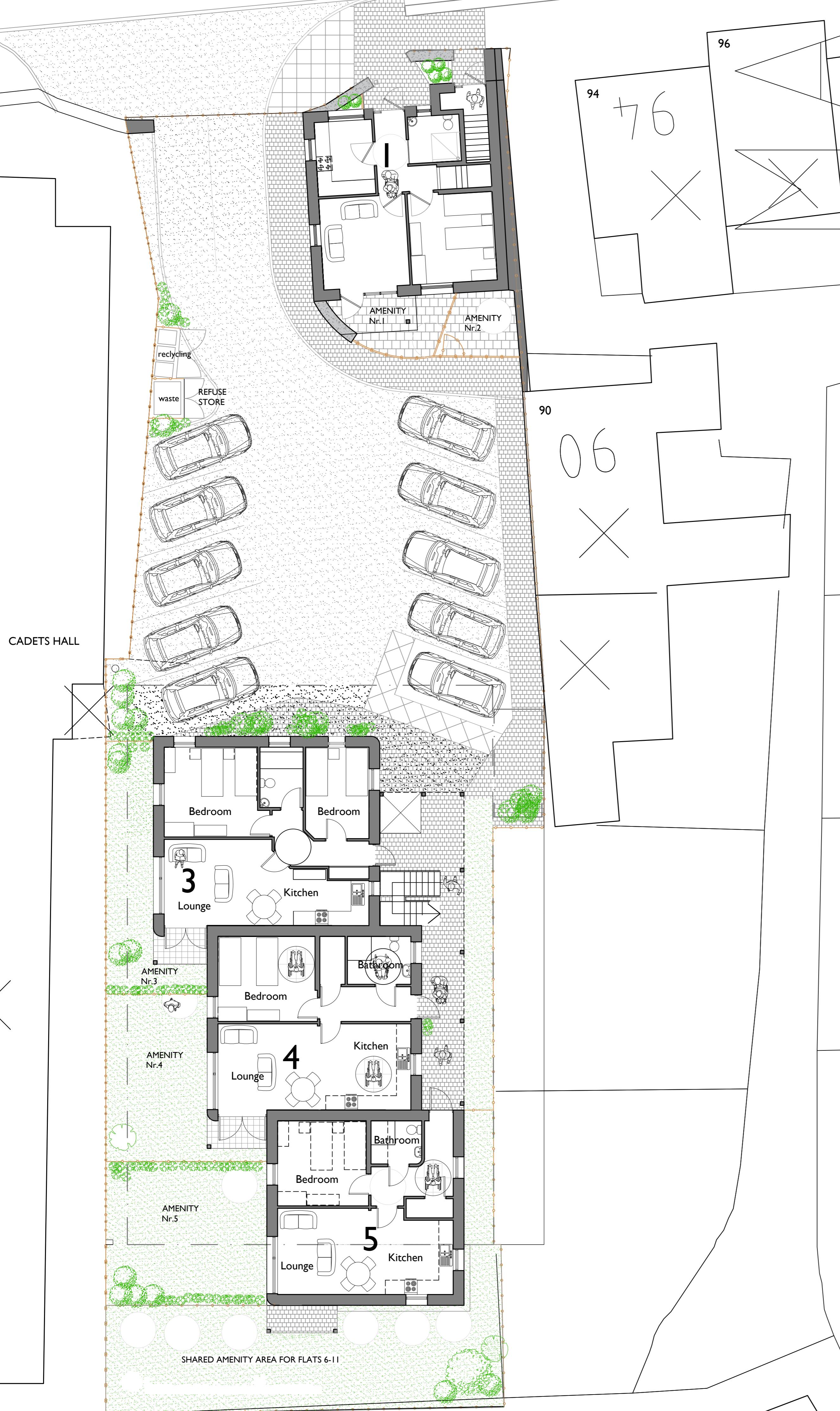
CYNLLUN LLAWR / GROUND FLOOR PLAN